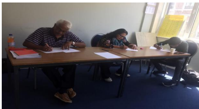
Hindi Students writing Level 3 exam at The Gandhi Centre