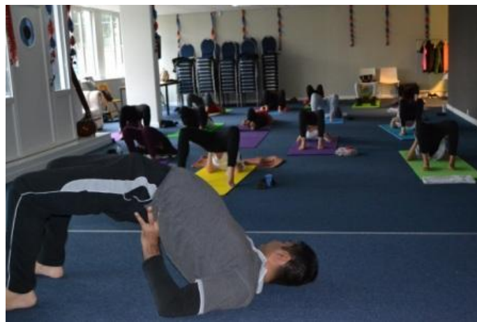
Yoga Class at The Gandhi Centre