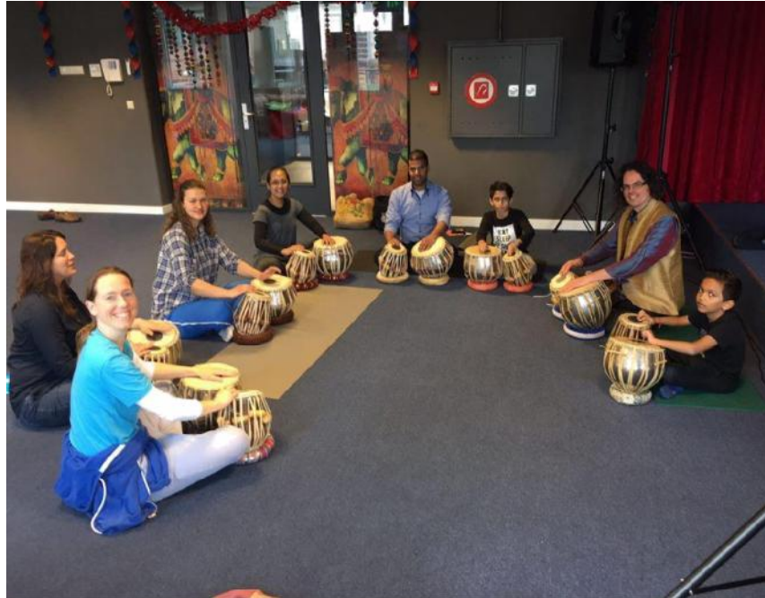
Tabla Class at the Gandhi Centre